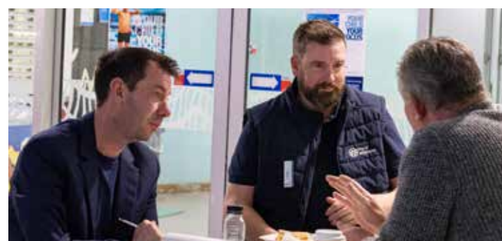
ABOVE Cr Colwell and Cr Brooks at Coffee with Council.