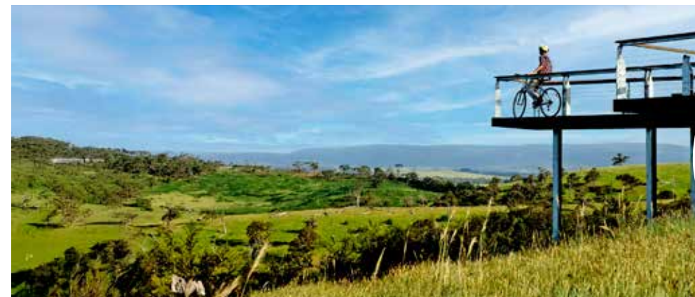
ABOVE bunjil nganga Parkland Quarry Hills.