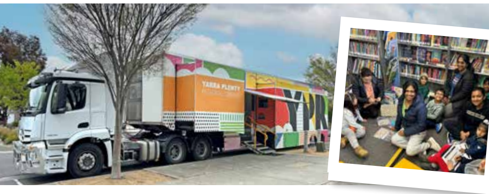
ABOVE The mobile library bus. RIGHT Families enjoying the Mobile Library children's area.