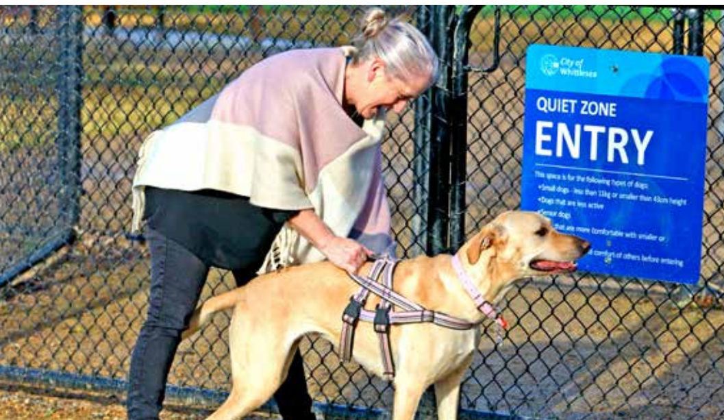
ABOVE make sure your pet registration and microchip registry contact information is correct.