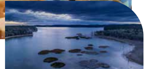
Yan Yean Reservoir Park, Yan Yean

For more information, visit whittlesea.vic.gov.au/BusinessDirectory