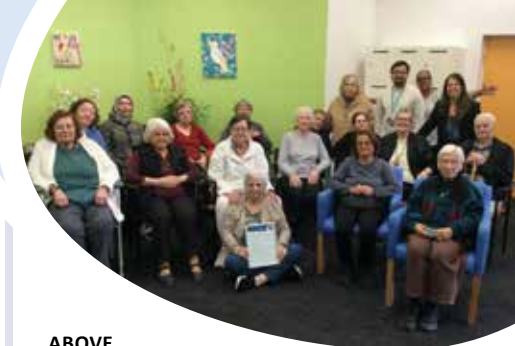
ABOVE Wonderful day of smiles and community spirit at our seniors program.

Learn more and apply at whittlesea.vic.gov.au/grants