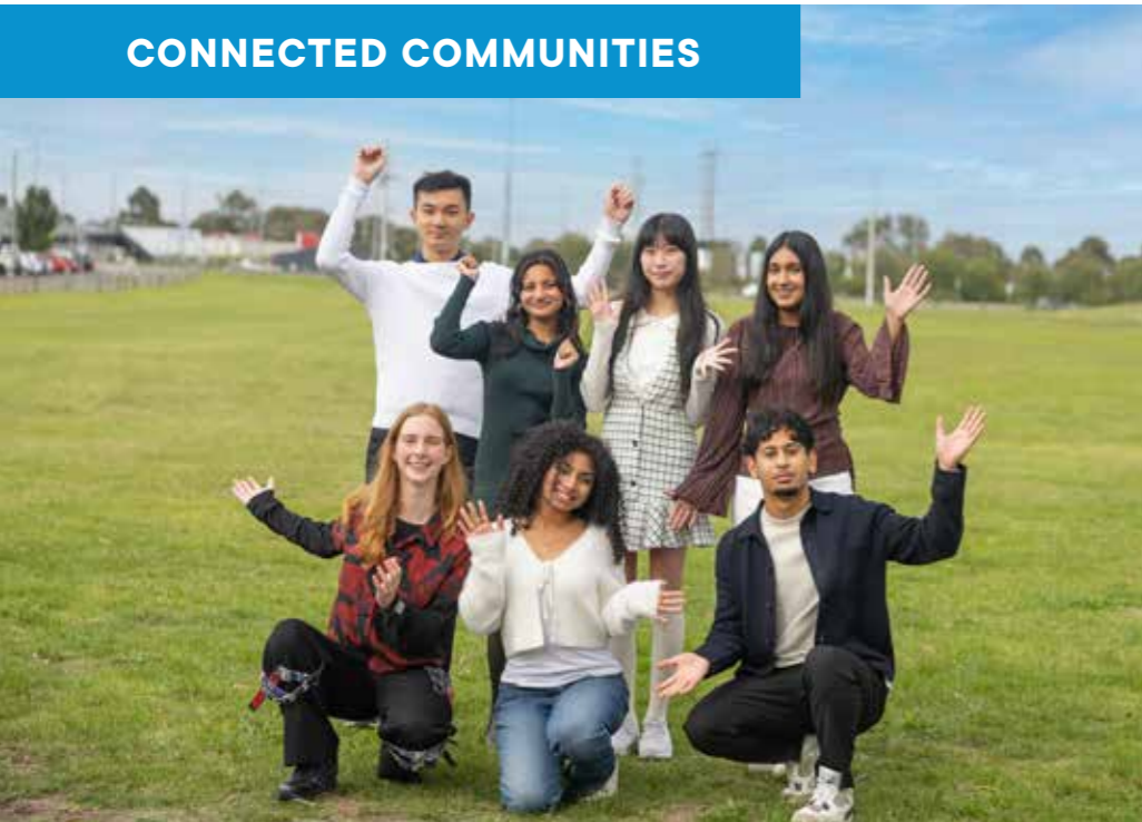
ABOVE City of Whittlesea Youth Councillors at the location for a new Youth Hub in South Morang.