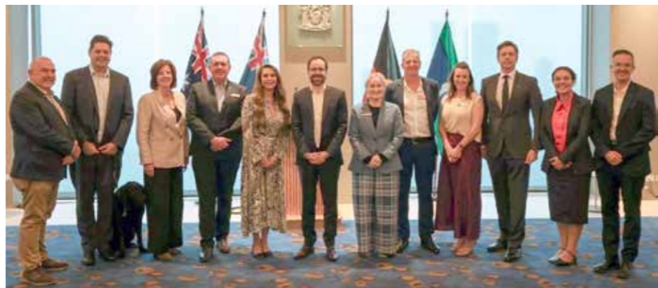
ABOVE Mayor Cr Cox is a member of the Local Government Mayoral Advisory Panel.