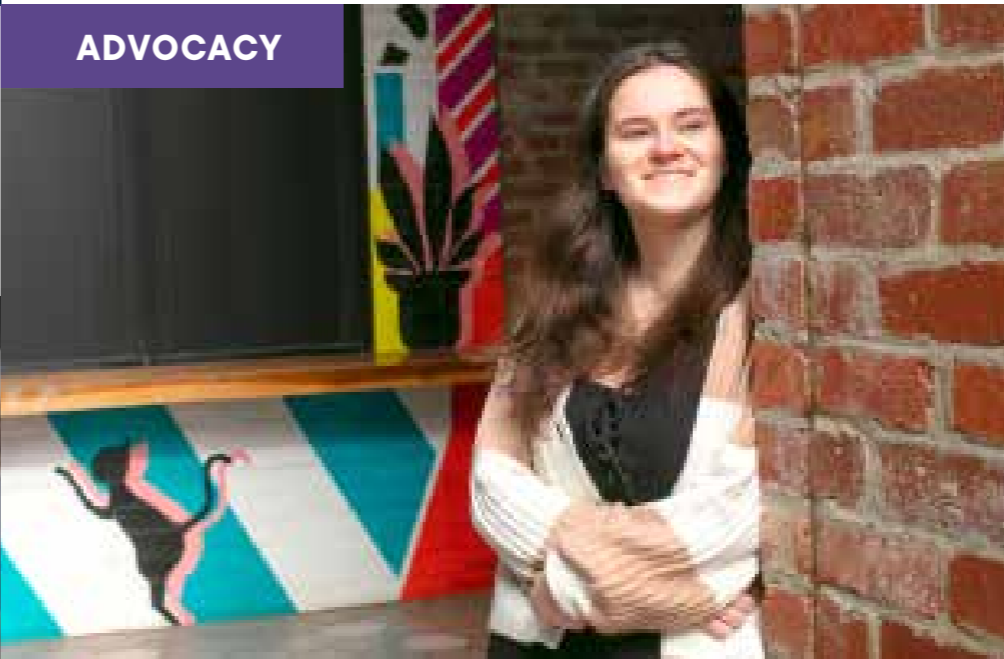
ABOVE Supporting young people through the delivery of a Youth Hub is a key priority for Council.