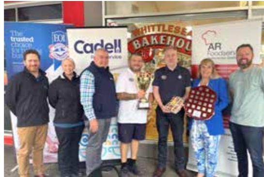
ABOVE Mayor Cr Cox at the Whittlesea Bakehouse – winner of the best hot cross bun; Mayor Cr Cox at Coffee with Council.