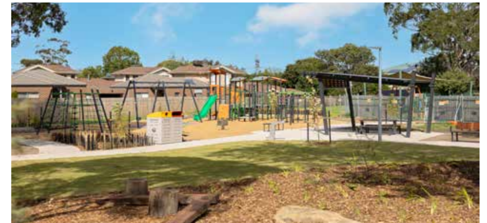
ABOVE The playground upgrade at Reid Street Park was completed in April.

The upgraded car park includes more than 80 parking spots, improved public lighting, updated drainage, new trees and landscaping, better footpaths and new signage and line marking. The car park redevelopment itself followed Council's $1.2 million revitalisation of the adjoining Gorge Road shopping precinct.