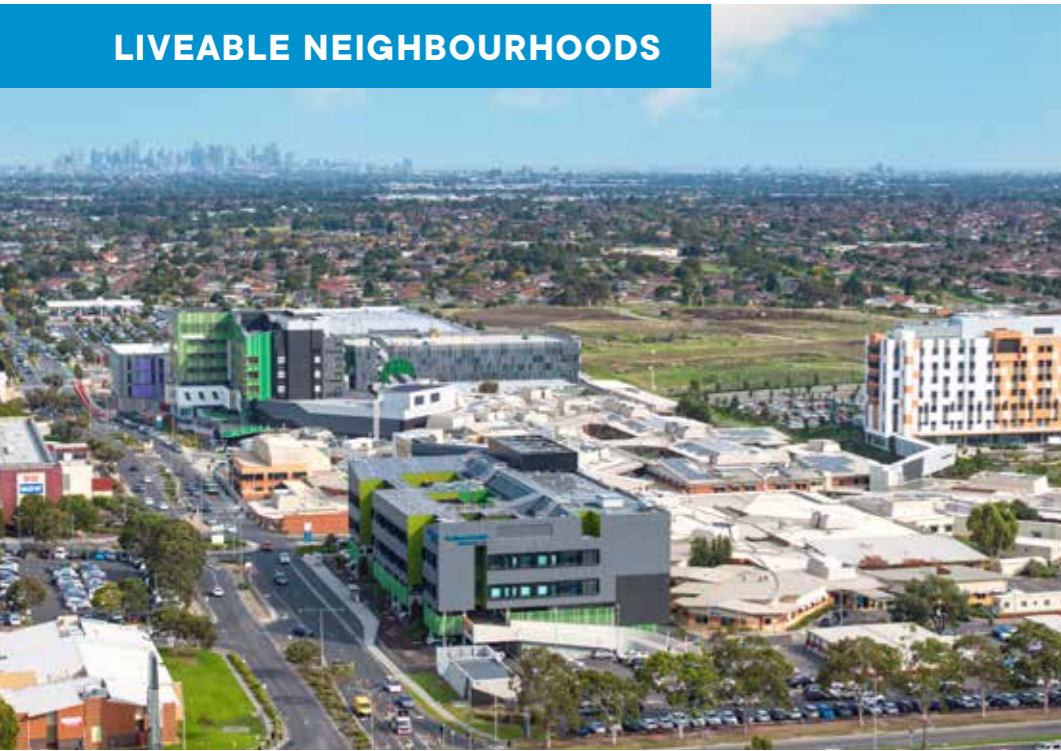
ABOVE Planning changes across Victoria will influence how housing, industry and neighbourhoods develop in the City of Whittlesea.