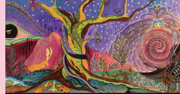
Artist credit: Contemplation , Ildiko Kormanyos, Annual Art Award 2025

Contact us on 9217 2170, option 4 to find out how we celebrate diversity and stay informed about upcoming catch ups and events.