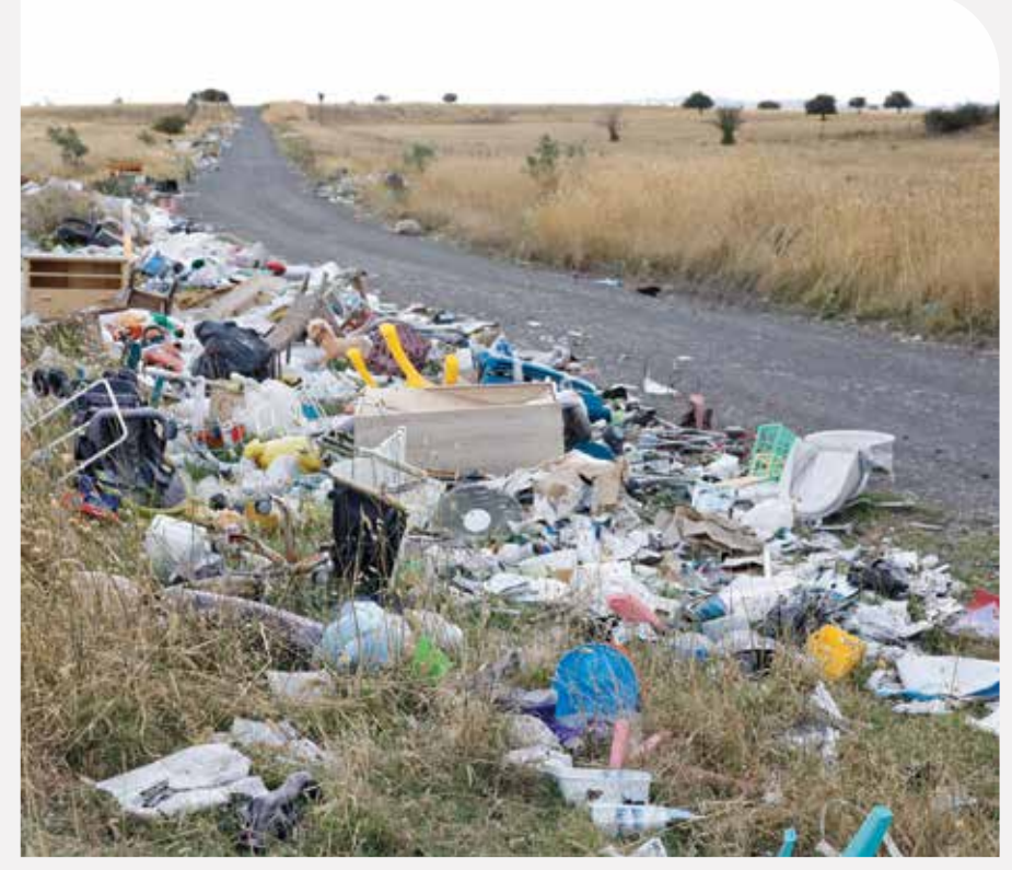
Illegally dumped rubbish in Wollert.