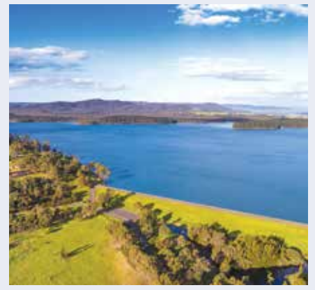
Yan Yean Reservoir.