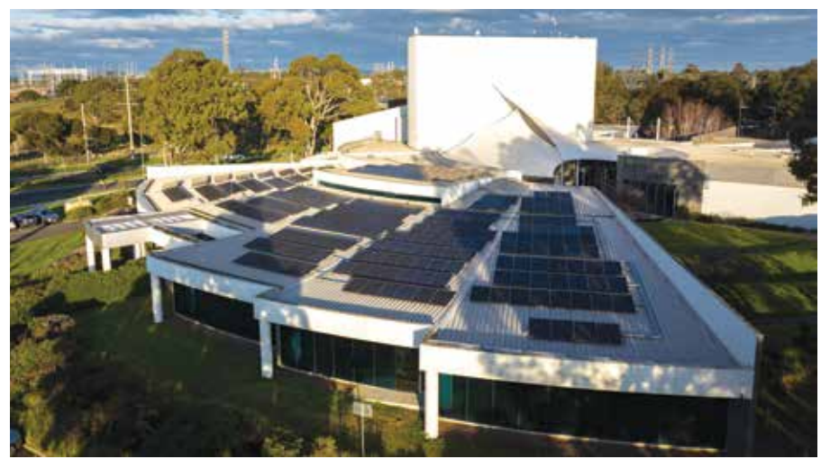
Solar panels on Plenty Ranges Arts and Convention Centre.