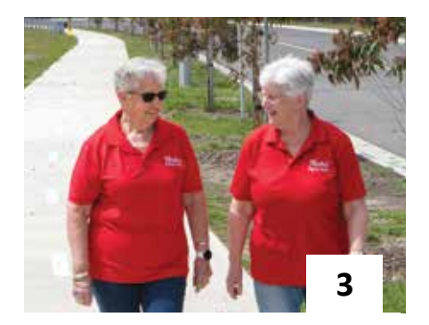
Road opening eases congestion