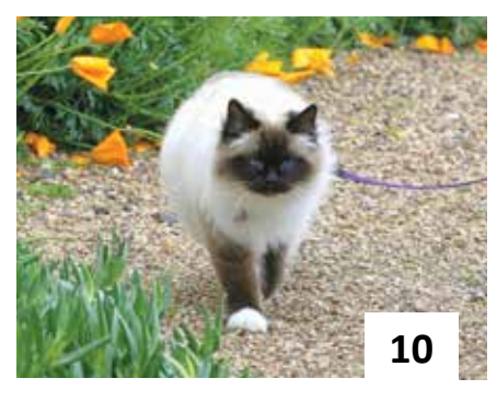
New rules now in place for cats