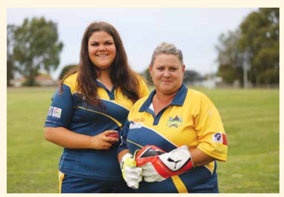
The Lalor Warriors Cricket Club was supported by a community grant in 2019.

You can find out more about the new Community Grants program including details about eligibility at www.whittlesea.vic.gov.au/grants