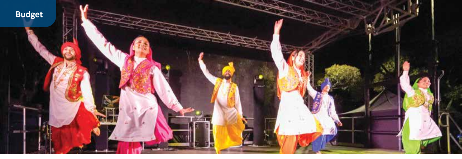
The revamped grants program will be able to fund a wider range of community events.