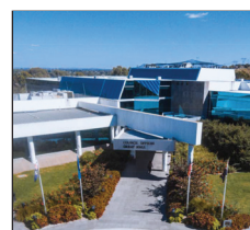
Civic Centre 25 Ferres Boulevard South Morang