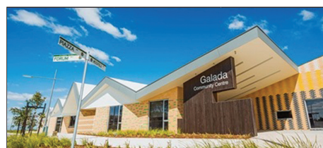
Galada Community Centre 10B Forum Way Epping North