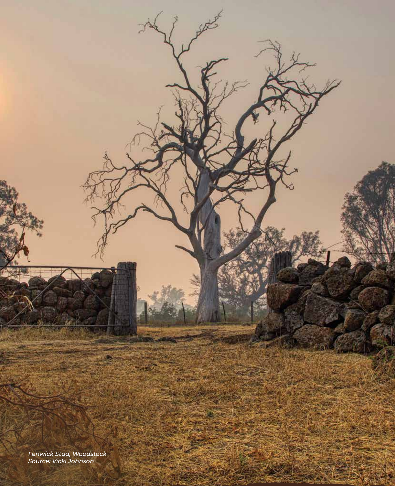
Fenwick Stud, Woodstock