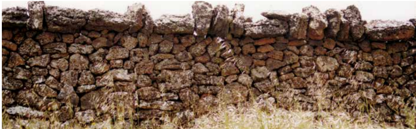
Cock and Hen