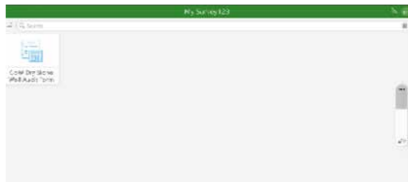
Screen showing main data groups will open.