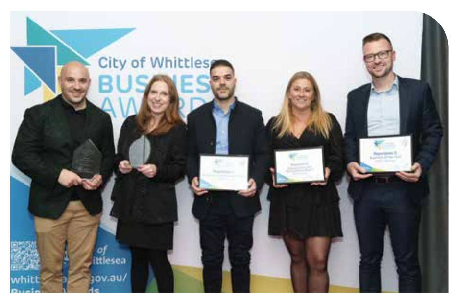
Business of the Year winners in 2023, Repurposelt.

For more information about the awards visit www.whittlesea.vic.gov.au/businessawards