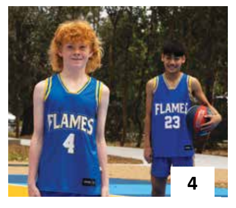
Teens head for Norris Bank