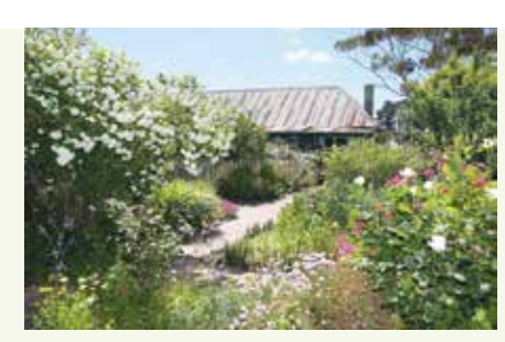
Ziebell's Farmhouse and Garden, Thomastown.

"I extend my heartfelt gratitude to the dedicated efforts of the Friends of Westgarthtown for their outstanding management of this facility, which stands as a unique and vital hub for arts