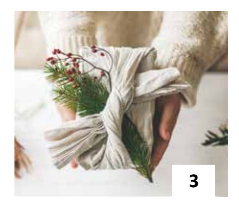
Be merry, sustainably