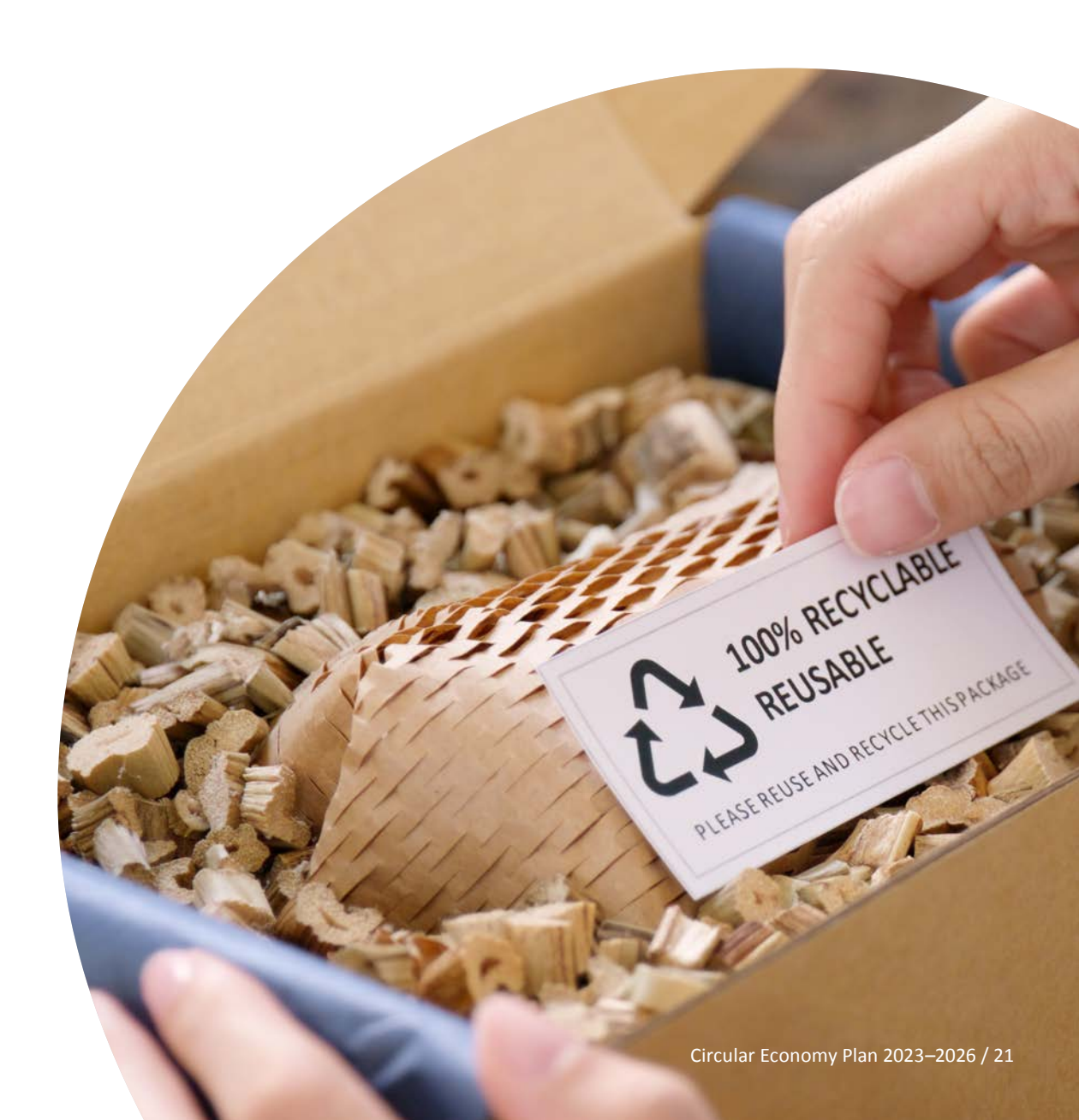
RIGHT 100% recyclable and reusable packaging